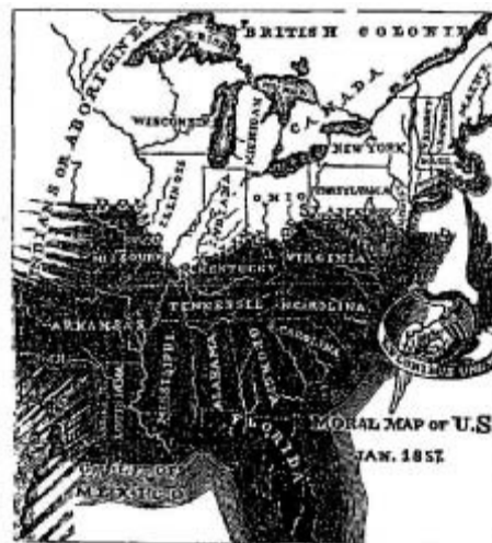
Slavery is a dark spot on the face of the nation.—Lafayette